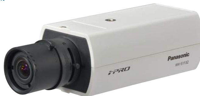
Lens : Optional