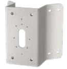
WV-Q183 Mount Bracket