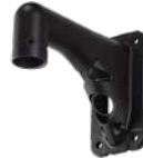
WV-QWL501-B Mount Bracket