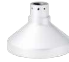
WV-QSR501-W Mount Bracket