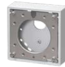
WV-QJB500-W Mount Bracket