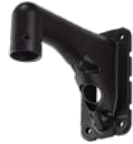
WV-QWL501-B Mount Bracket