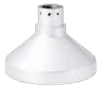
WV-QSR501-W Mount Bracket