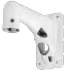
WV-QWL501-W Mount Bracket