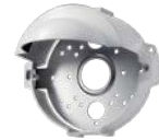
WV-QSR500-W Sun Shade