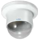
WV-QCD100C-W Dome Cover