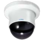
WV-QCD100G-W Dome Cover