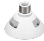
WV-QSR504M1-W Mount Bracket