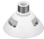
WV-QSR504M-W Mount Bracket