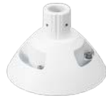
WV-QSR504-W Mount Bracket