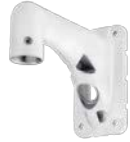
WV-QWL501-W Mount Bracket