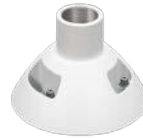
WV-QSR504F1-W Mount Bracket