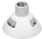
WV-QSR504F-W Mount Bracket