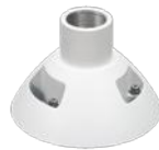
WV-QSR504F-W Mount Bracket