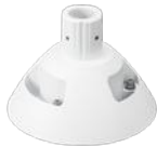
WV-QSR504-W Mount Bracket