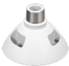
WV-QSR504M1-W Mount Bracket