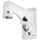
WV-QWL501-W Mount Bracket