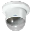
WV-QCD100C-W Dome Cover