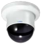
WV-QCD100G-W Dome Cover